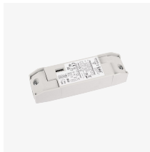
Driver DALI & PUSH EU 300-1050mA 3-38W 220-240V Ref. 4.3069.6101