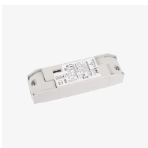
Driver DALI & PUSH 150-700mA 7-29W 220-240V Ref. 4.1069.6101