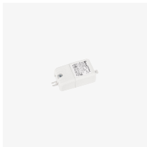
Driver ON-OFF EU 500mA 2,5-22W 200-240V Ref. 4.3062.1101