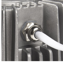
IP65 cable gland