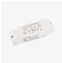
Driver ON-OFF 150-500mA 6,3-21W 240V Ref. 4.1069.1101