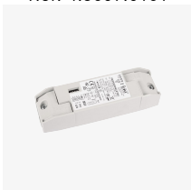
Driver DALI & PUSH 150-700mA 7-29W 220-240V Ref. 4.1069.6101