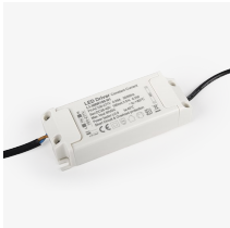
IP20 Driver included