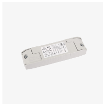
Driver ON-OFF EU 700mA 3,5-30W 200-240V Ref. 4.3063.1101