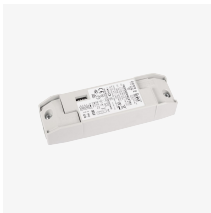
Driver DALI & PUSH EU 300-1050mA 3-38W 220-240V Ref. 4.3069.6101