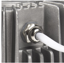
IP65 cable gland