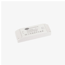
Driver ON-OFF 700mA 14-30W 100-240V Ref. 4.1013.1106